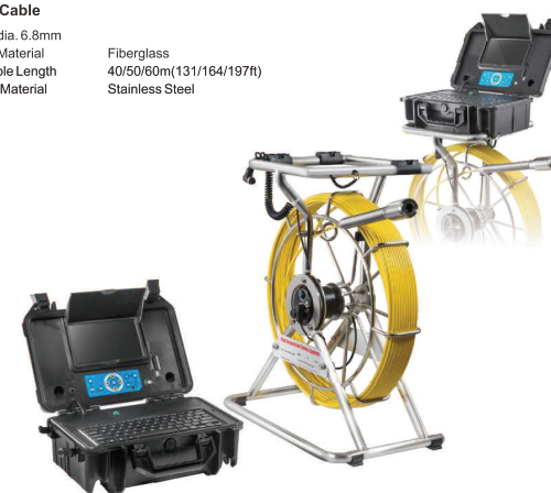
3399FB with monitor and keyboard mounted in a rain resistant box

See price list for complete list of different options, part numbers, spare parts and prices. ALL PRODUCTS, PRODUCT SPECIFICATIONS AND DATA ARE SUBJECT TO CHANGE WITHOUT NOTICE TO IMPROVE RELIABILITY, FUNCTION OR DESIGN OR OTHERWISE