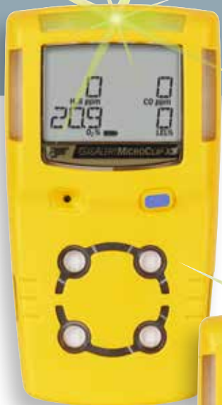
GasAlert MicroClip X3

Guaranteed to run for an entire shift — even in harsh weather.