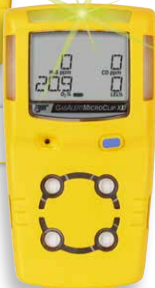
GasAlert MicroClip XL

NEW! GasAlertMicroClip X3 and GasAlertMicroClip XL now feature IP68 for maximum water and dust protection — up to 45 minutes at a depth of 1.2 m.