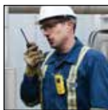
Easy To Wear